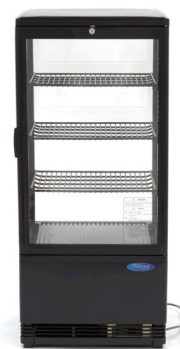
Black display fridge with lock in door