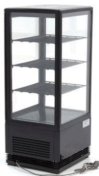
Double glazing on 4 sides